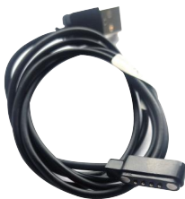
Magnetic charging wire(X1)