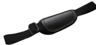
Hand strap (x1)