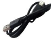
USB cable (x1)