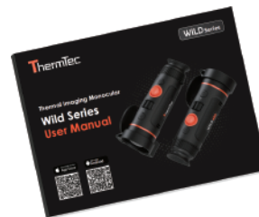
User manual (x1)