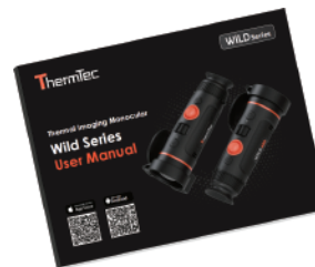
User manual (x1)